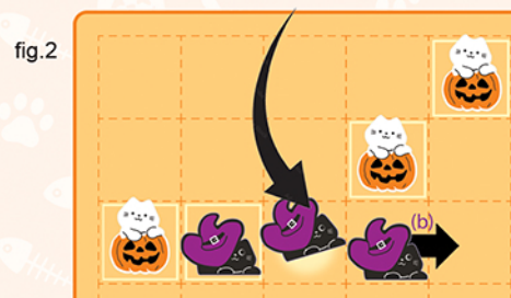
When the Purple Kitten is played, Kitten (b) gets booped, but the other Kittens don't move because they cannot be booped into each other. The line of two (or more) prevents it.