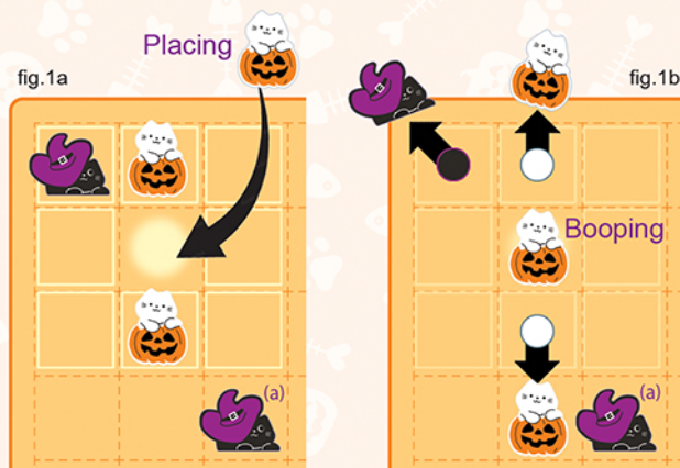
Adding the Orange Kitten does not create a line of three. Instead, anything adjacent (yellow area) is pushed one space away.

In the rare case of lining up more than three in a row, or multiple connected 3's, choose which group of 3 to graduate, leaving the remaining pieces on the board. (fig. 4) Likewise, if you have both a three in a row and eight pieces on the board, choose which you would activate.