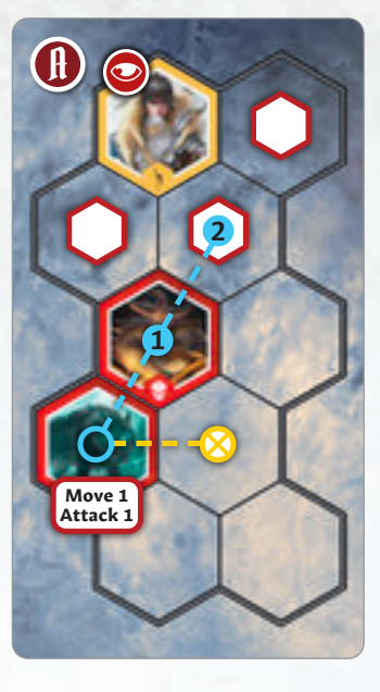
The Hound needs 2 movement points to shorten the path to its attack hex, but it only has 1, so it does not move.