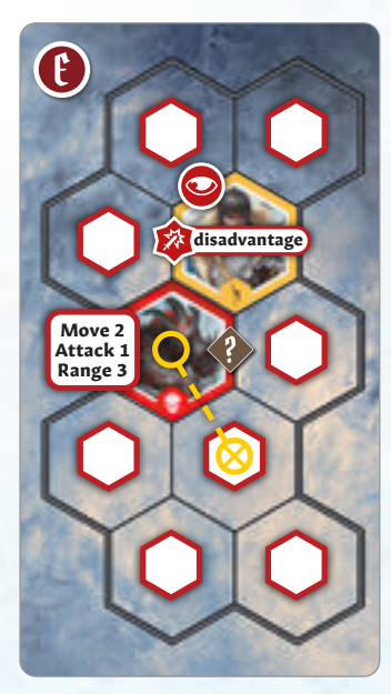
The Algox Archer has muddle and thus will attack with disadvantage regardless, so it does not move away from its focus.