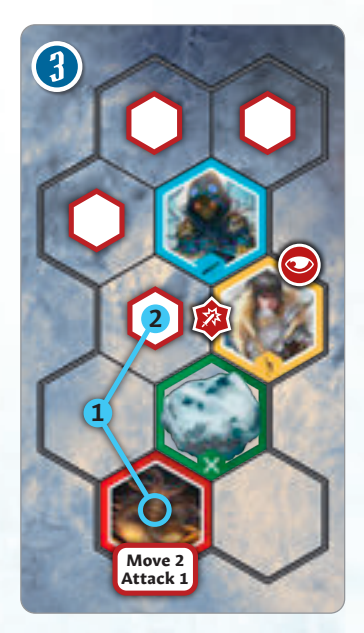
The two enemies require equal movement paths, so the Algox Guard focuses on the enemy closer by range.