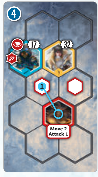
The two enemies are equally close by range, so the Algox Guard focuses on the enemy earlier in the initiative order.