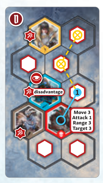
The Algox Archer moves to the closest attack hex from which it can attack all three enemies and only have one attack with disadvantage.