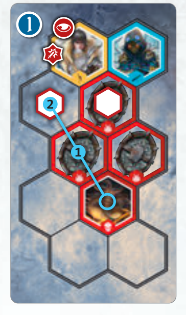
The Algox Guard focuses on the enemy it can attack while springing the fewest traps.

Check for movement paths to attack hexes (i.e., hexes from which an attack can be performed). These hexes are shown with the () icon in diagrams. If no path exists, the monster cannot find a focus and will not move or attack.