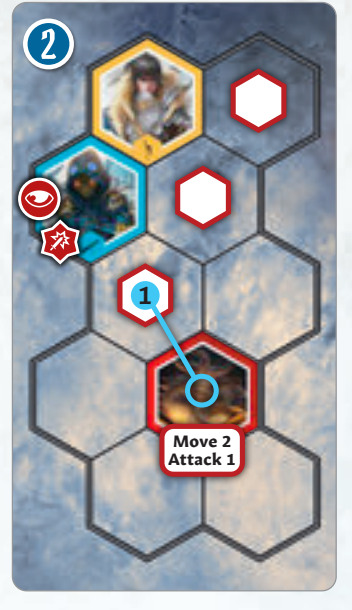
The Algox Guard focuses on the enemy it can attack while using the fewest movement points.