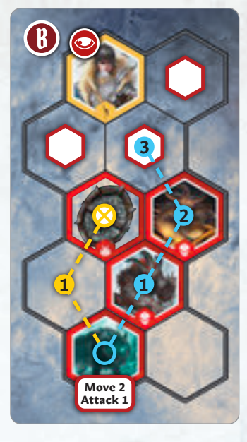
The Hound has enough movement points to shorten the path to its attack hex, but only if it springs a trap, so it does not move.