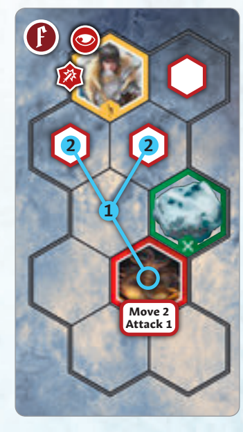
The Algox Guard has two equally viable attack hexes, so the party decides which of those attack hexes it moves to.