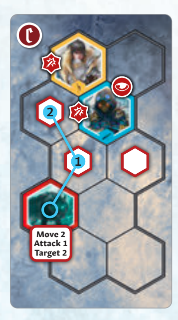
The Hound can attack two enemies, so it moves to the only attack hex from which it can attack both of those enemies.